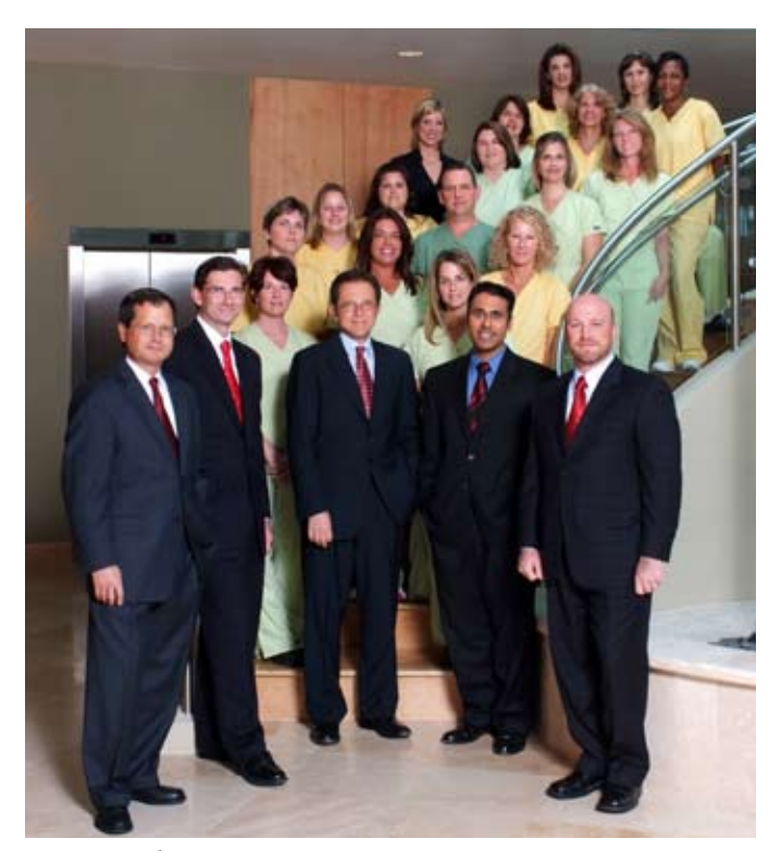
The doctors and staff of Sarasota Vascular Specialists.

Our Vascular Laboratory, featured as the gold-standard facility by ABC Television's Prime Time when it evaluated vascular labs in Florida, was the first lab in Sarasota County to be certified by the Intersocietal Commission for the Accreditation of Vascular Laboratories (ICAVL), and all eight of our sonographers are Registered Vascular Technologists.